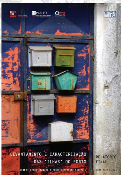
Levantamento e caracterização das 'ilhas' do Porto

Ferreira S, Falcão L, Couto A (2015) The quality of the injury severity classification by the police: an important step for a reliable assessment, Safety Science 79, 88-93.