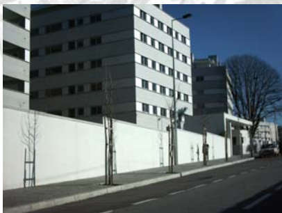
Fragmentos utópicos na cidade caótica: condomínios fechados no Grande Porto