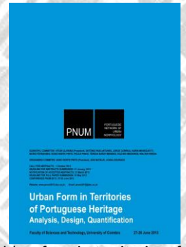
PNUM 2013: Urban form in territories of Portuguese heritage: analysis, design, quantification, FCTUC - Coimbra. 27-28 June.

CITTA 2013: Responsive Transports for Smart Mobility, FCTUC - Coimbra. 17 May.