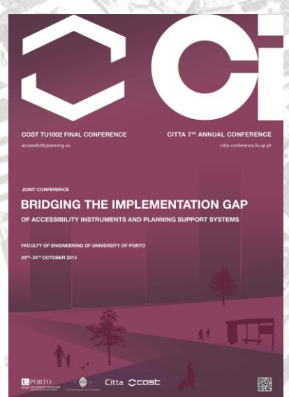
7<sup>th</sup> CITTA Annual Conference - Bridging the Implementation Gap of Accessibility Instruments and Planning Support Systems, 23-24 October 2014, FEUP, Porto.

21<sup>st</sup> International Seminar on Urban Form - Our Common Future in Urban Morphology, 3-6 July 2014, FEUP, Porto.